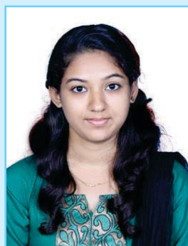
GIPHY SUSAN II RANK