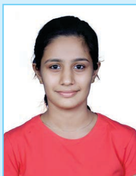
GLANCY KSUNNY I RANK