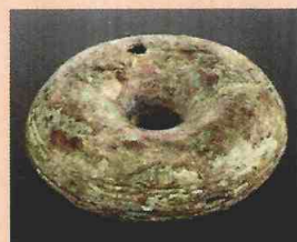
Bronze Pessary (200 BC - 400 AD)